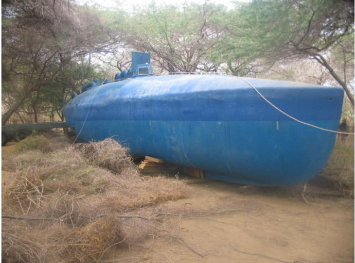
Semi-submersible vessel recovered in La Guajira, Colombia, 5 th August 2007