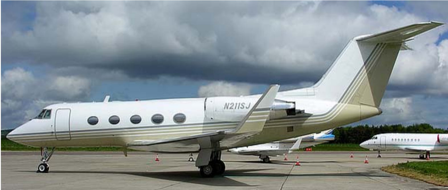
Aircraft intercepted with two tons of cocaine destined for West Africa and onto Europe