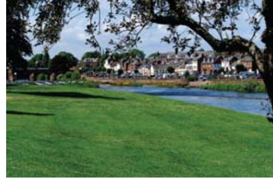
River Nith, Dumfries